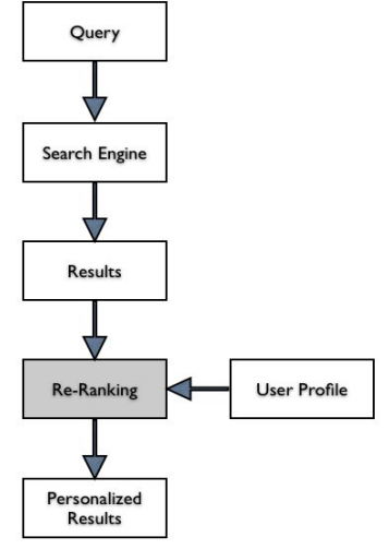
Fig 1. Reranking process

In this scenario too, the retrieved results are compared with the database to see if any clickthroughs are already stored for the query. If there are any click throughs stored for that search query with equal click values for each result, then the results are displayed as top results according to the order in which their clickthroughs are stored in the database.